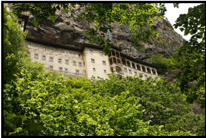
The ancient trade center of Aspendos has one of the world's best-preserved amphitheatres.